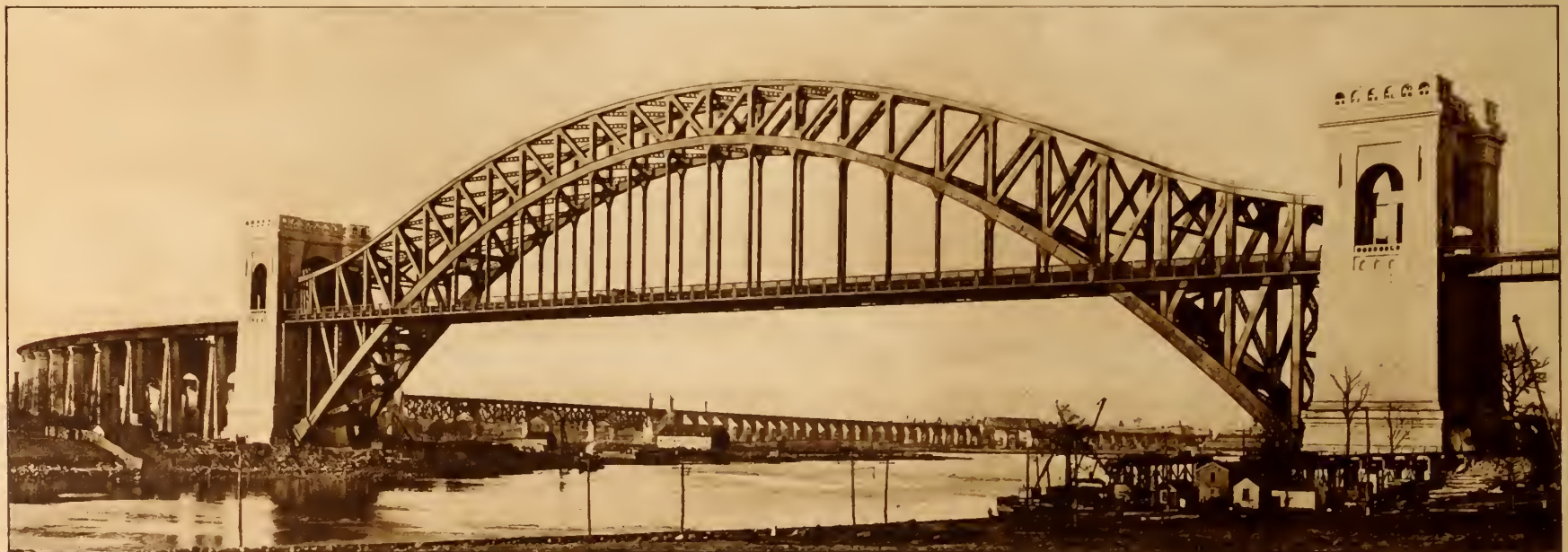
HELL GATE BRIDGE, connecting Pennsylvania Railroad trains in Brooklyn to the New Haven trains. One of the largest bridges in the world, extending a thousand feet in length.